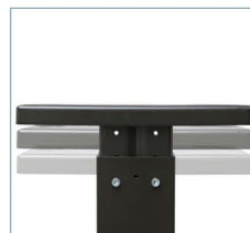
Height adjustable stand for optimal ergonomics