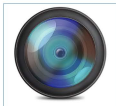
Contex CCD with ALE ensures precision of 0.1% accuracy

HD Ultra scanners are for customers who require a high throughput of documents, great flexibility and unmatched performance.