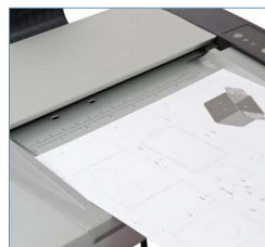
Support your documents with paper feed guides