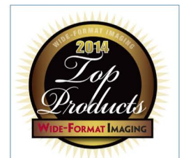
Contex HD Ultra awarded Best Wide Format Scanner for third consecutive year