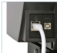
Fastest bandwidth in the industry w/ Gb Ethernet and xDTR2