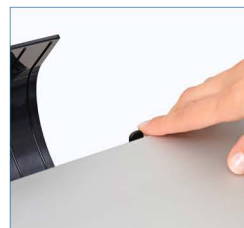
Easily adjust paper pressure to protect fragile documents