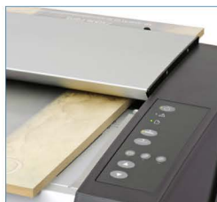
Scan thick originals with automatic thickness control (ATAC)