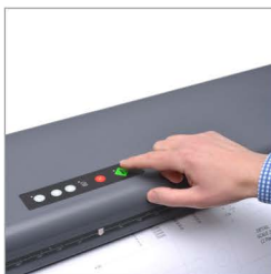
Flexible control panel for easy handling

Scan and document all your architectural, engineering and construction plans in standard file formats directly into your project folders.