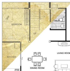
Improve your originals