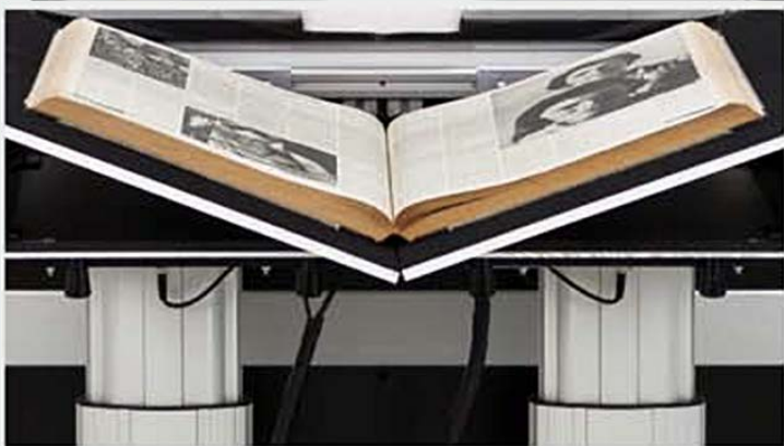
Scanning a book using the protective V cradle for fragile bound documents.

Together with software packages such as Batch Scan Wizard, BCS-2®, FreeFlow and Opus Goobi UCC, even the toughest requirements of a digitization project can be met.