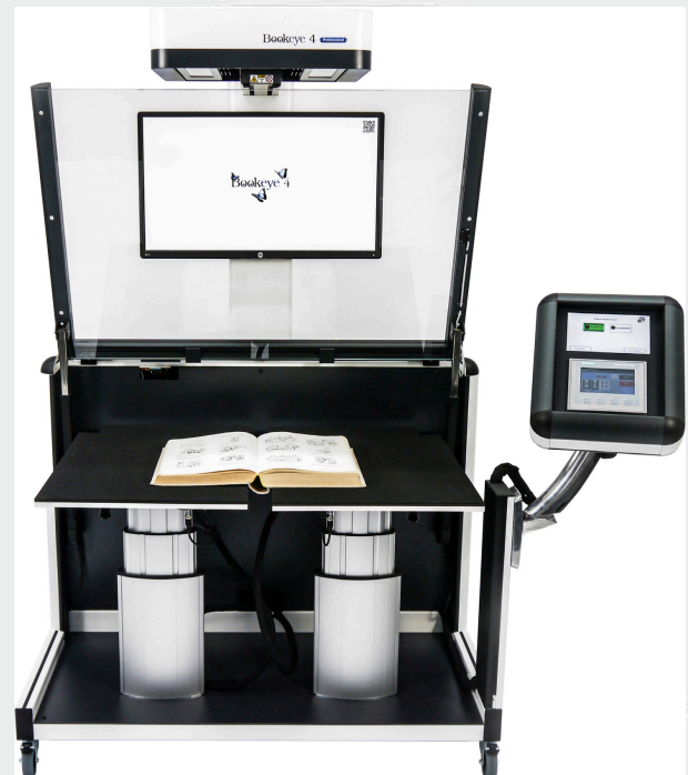
Motorized book cradle at 35cm height