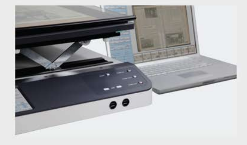
The motorized book cradles move to position the book against the glass plate.