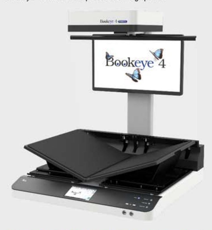
Scanning a book using the protective V cradle for fragile bound documents.

Bookeye<sup>®</sup> 4 V1A is suitable for digitization projects that require high quality and maximum productivity, even in 24/7 operation. Originals up to A1+, such as books, magazines, posters, folders or bound documents of all kinds, can be digitized by the Bookeye<sup>®</sup> 4 V1A at unsurpassed scanning speed.